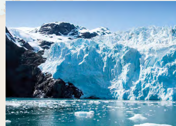
Hubbard Glacier, Alaska