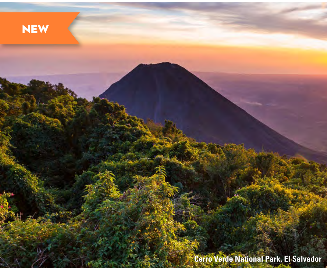
Cerro Verde National Park, El Salvador