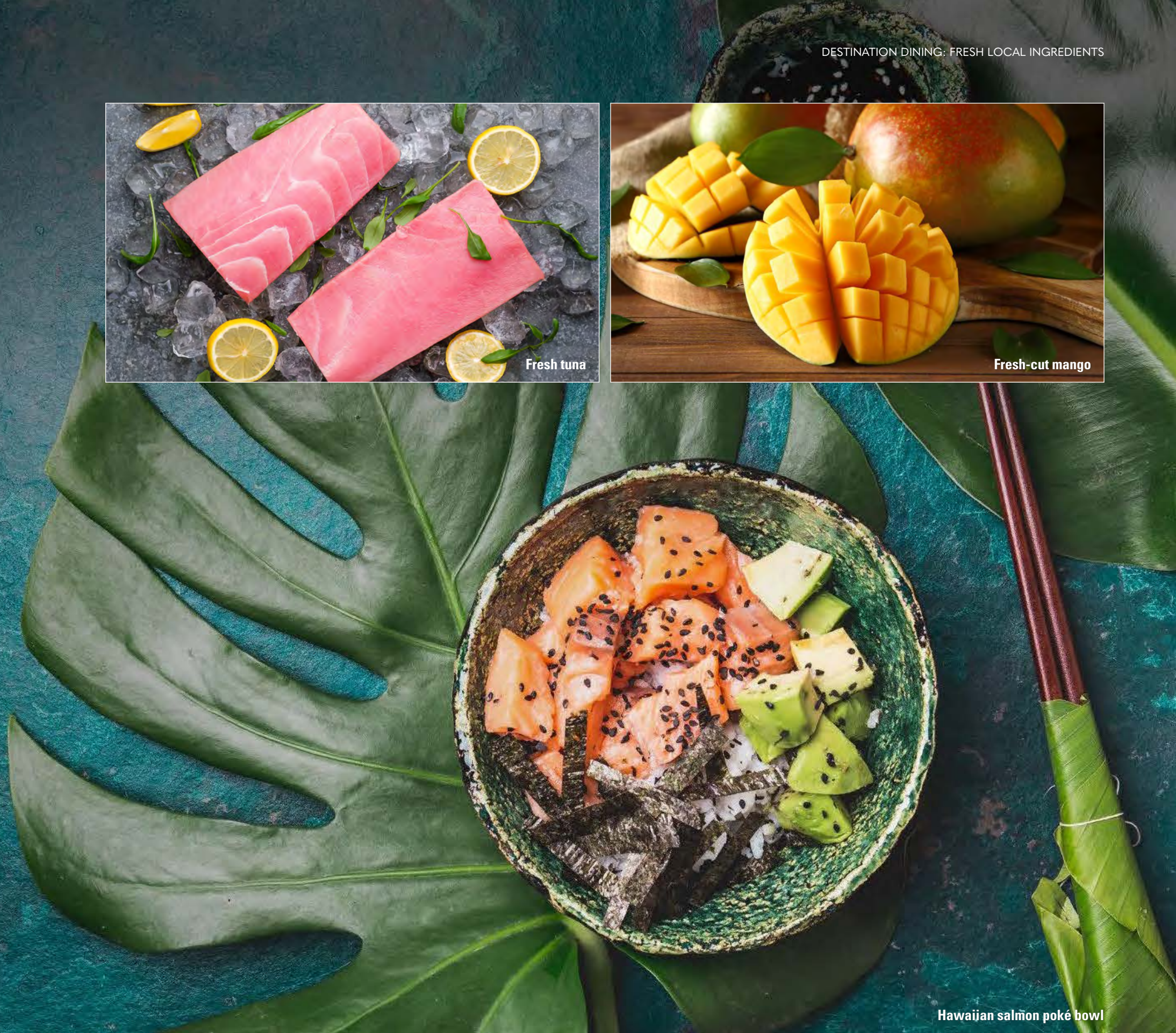
Hawaiian salmon poke bowl