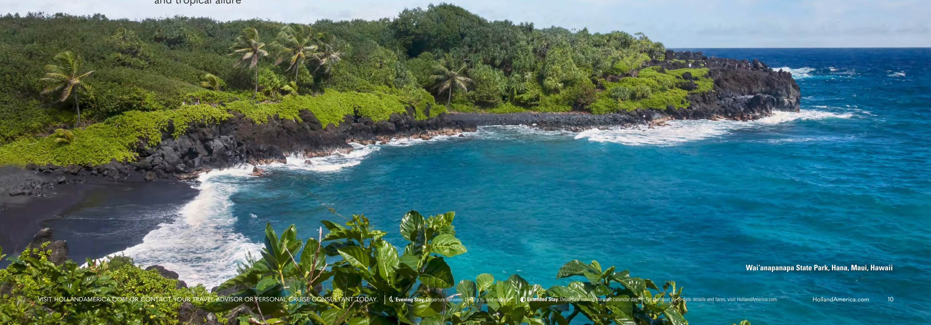
Wai'anapanapa State Park, Hana, Maui, Hawaii