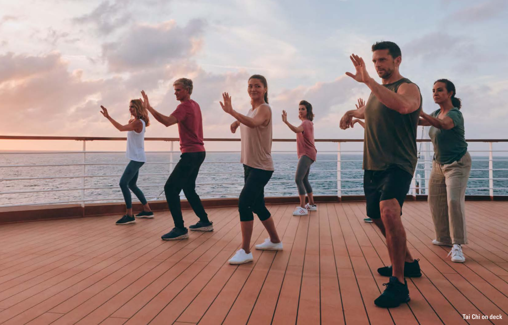
Tai Chi on deck

Begin your day with a Sunrise Hawaiian Blessing on deck or a stroll around our teak Promenade Deck. Watch a cooking demonstration, make a kukui bracelet, or paint a masterpiece at one of our guided painting sessions. Later, catch an interactive game show, test your knowledge with team trivia, or enjoy hula and ukulele at our Aloha Sunset Music Hour.