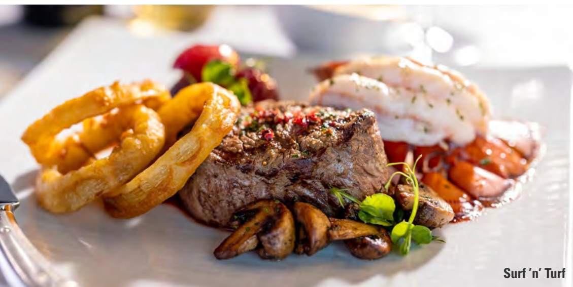
Surf 'n' Turf