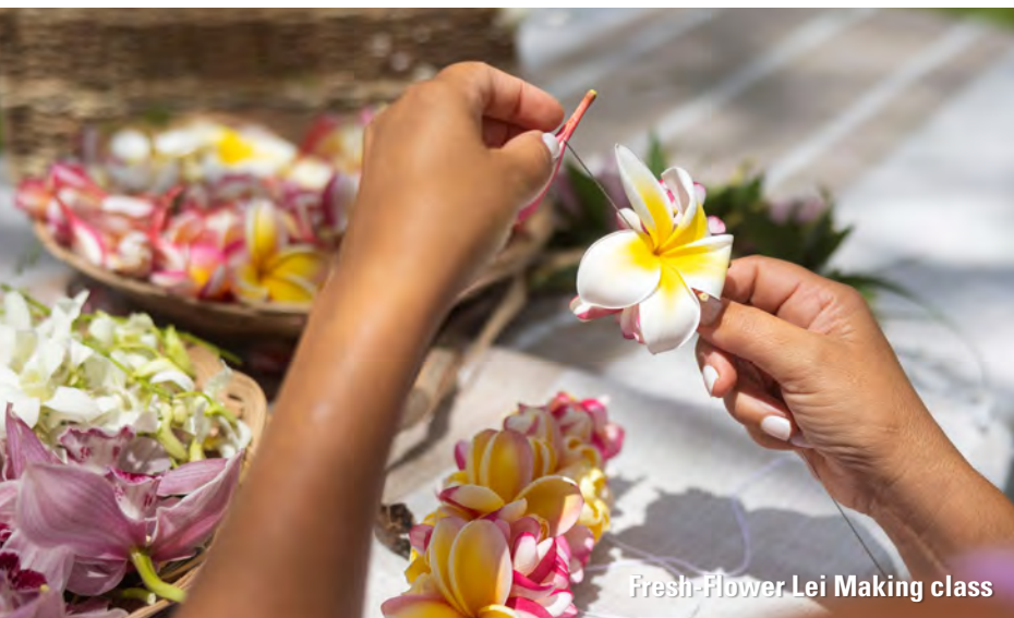
Fresh-Flower Lei Making class