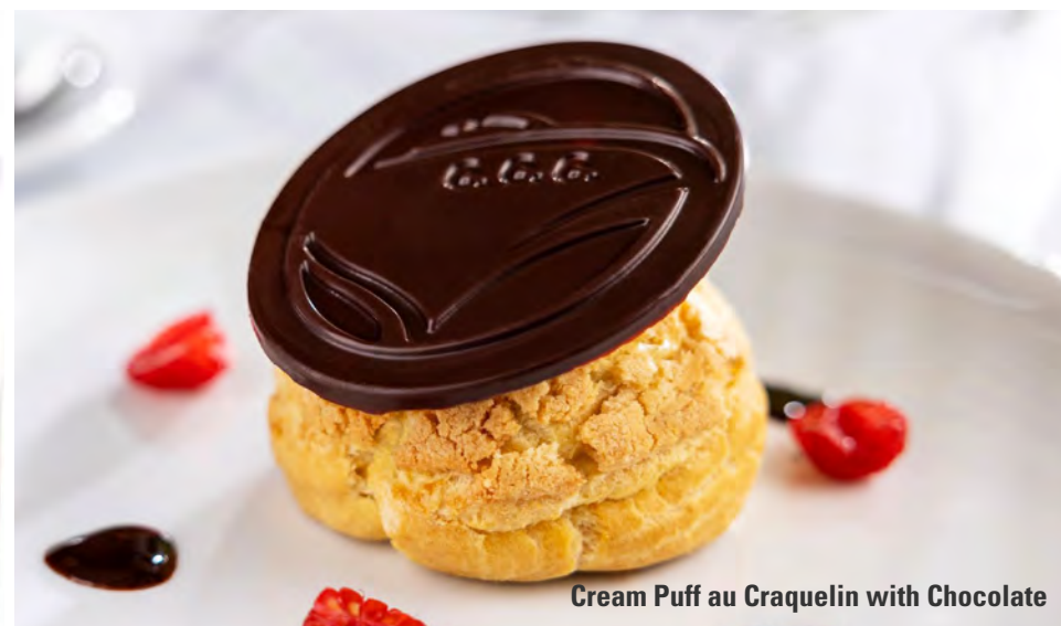
Cream Puff au Craquelin with Chocolate