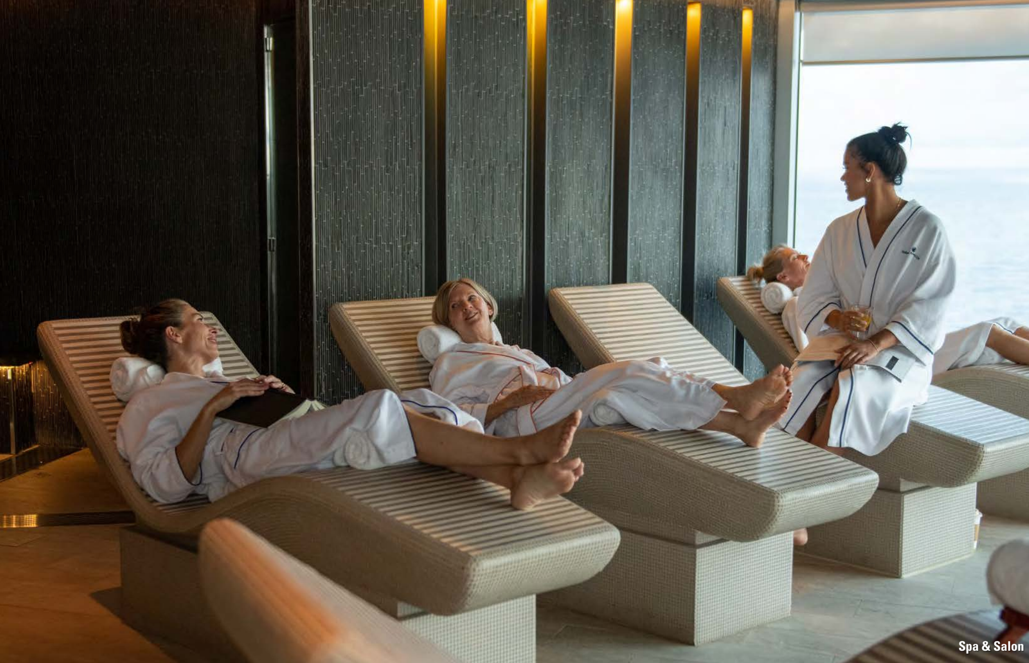
Spa & Salon