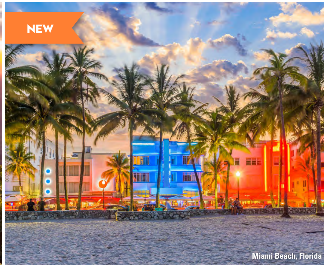
Miami Beach, Florida