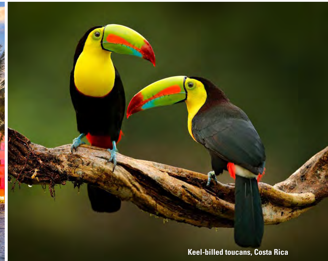
Keel-billed toucans, Costa Rica

Also new for 2025-2026 are our Panama Canal cruises on board Zuiderdam , which begin or end in Miami. While here, visit the iconic Miami Beach, the South Beach Art Deco district, the Wynwood Walls outdoor street art museum, or Little Havana, where the scents and sounds of Cuban cigars and salsa music waft through the air.