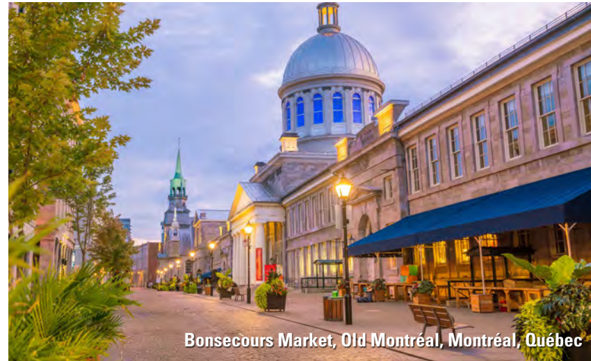
Bonsecours Market, Old Montréal, Montréal, Québec