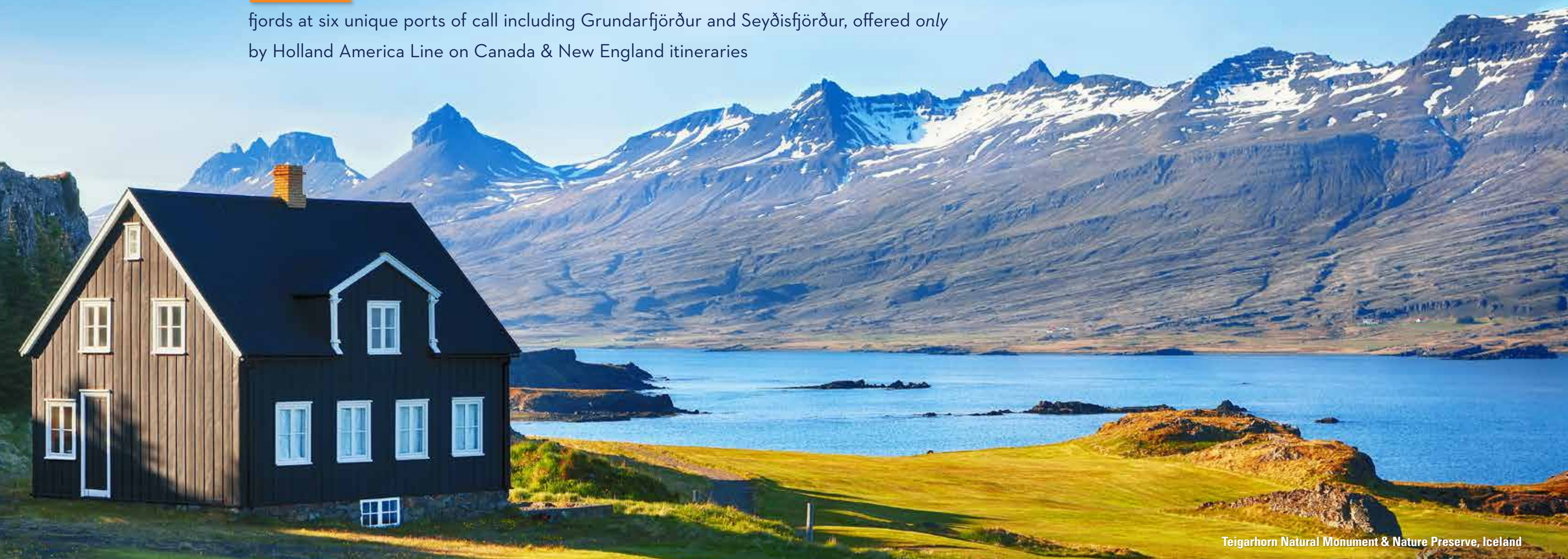
Teigarhorn Natural Monument & Nature Preserve, Iceland