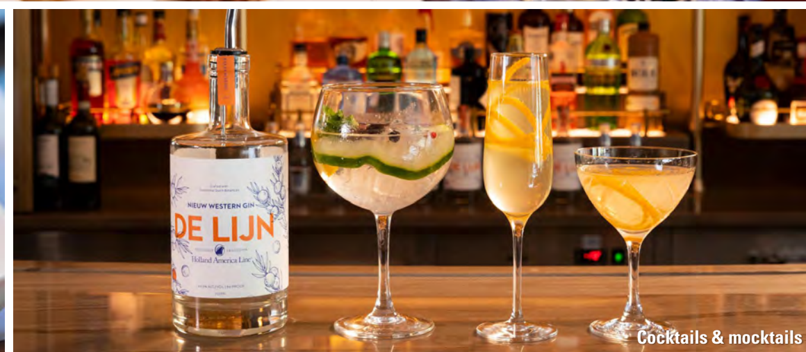
Cocktails & mocktails