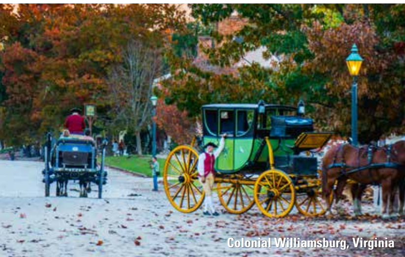
Colonial Williamsburg, Virginia

Explore further afield in two very different destinations. Immerse yourself in the United States' colonial history in Yorktown (Williamsburg), where lovingly restored and preserved structures, sites, and stories document the tales and triumphs of the American Revolution. In Cap-aux-Meules, soak in Les Îles-de-la-Madeleine's enduring heritage and quintessential charm.