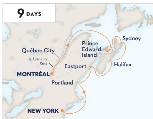
9 DAYS COLONIAL NEW ENGLAND: MONTRÉAL MONTRÉAL TO NEW YORK Volendam Sep 28