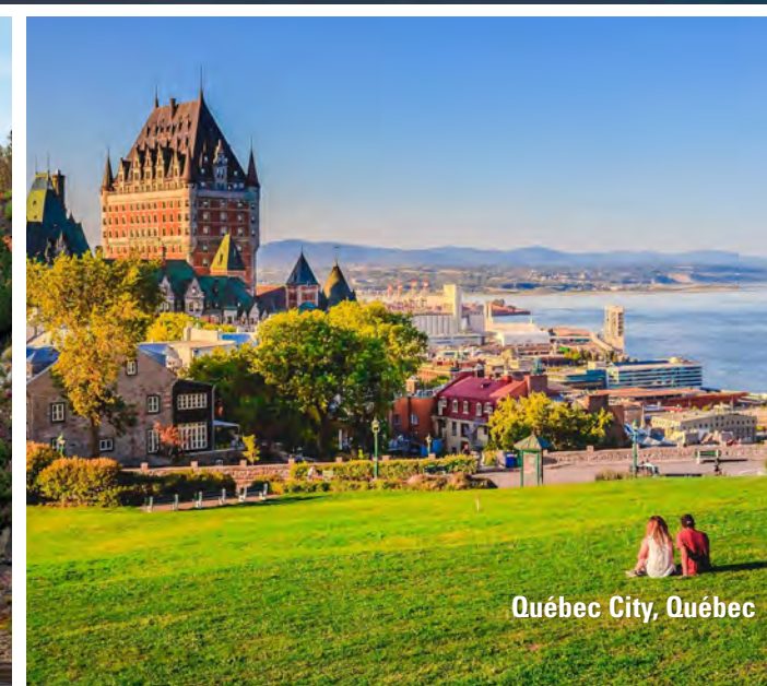
Québec City, Québec