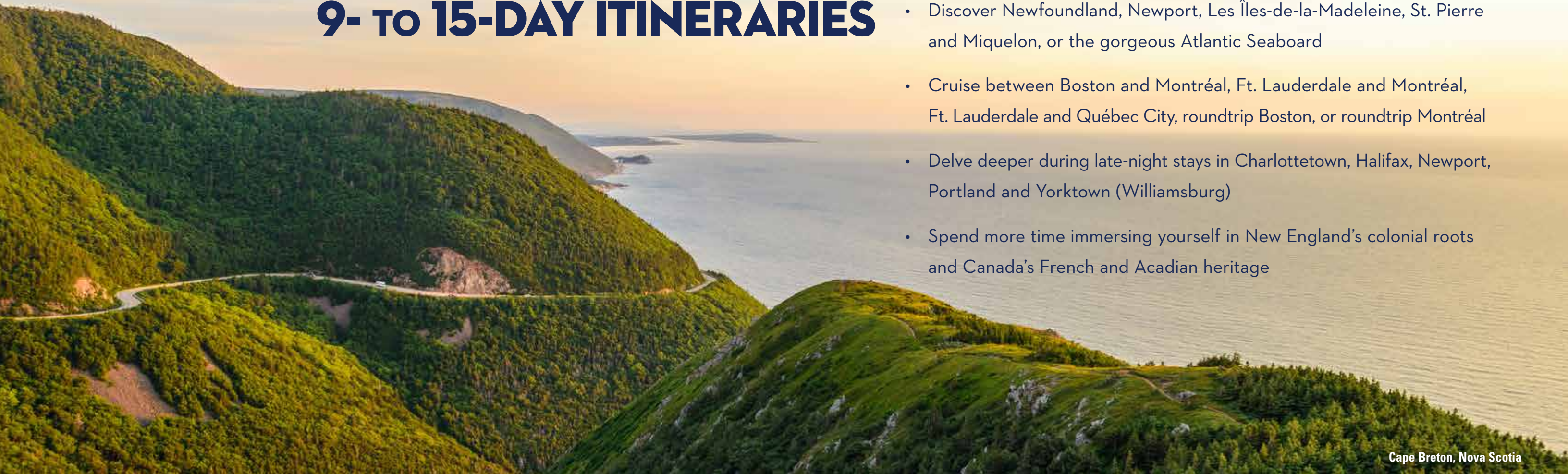
Cape Breton, Nova Scotia