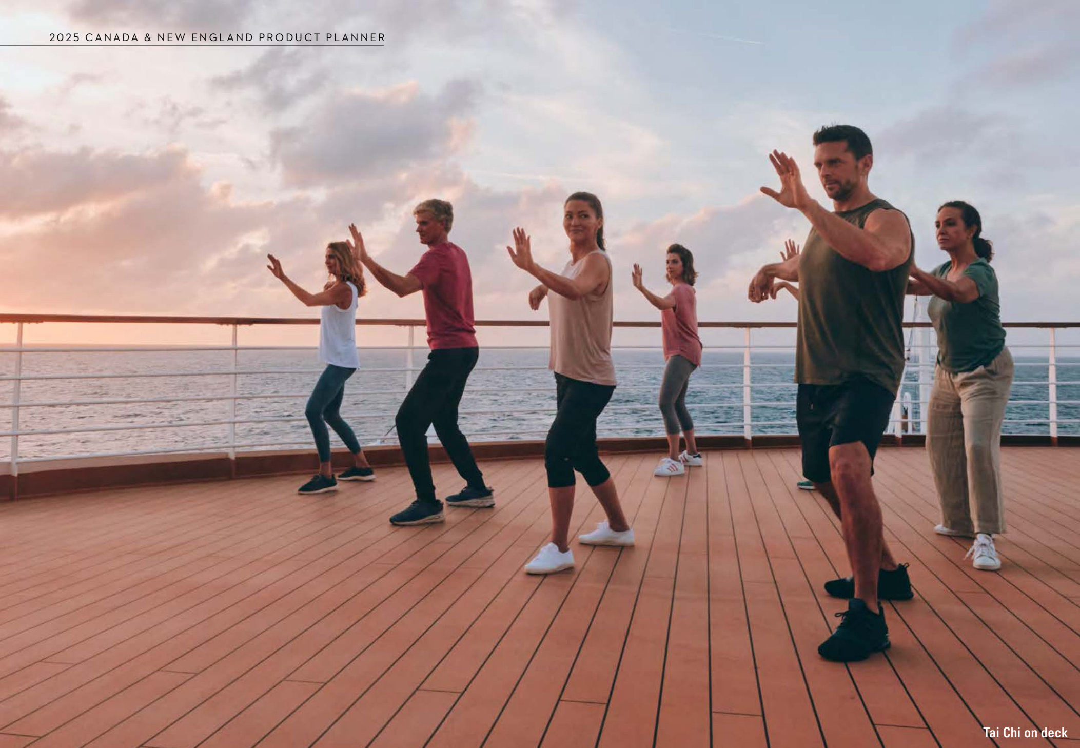
Tai Chi on deck