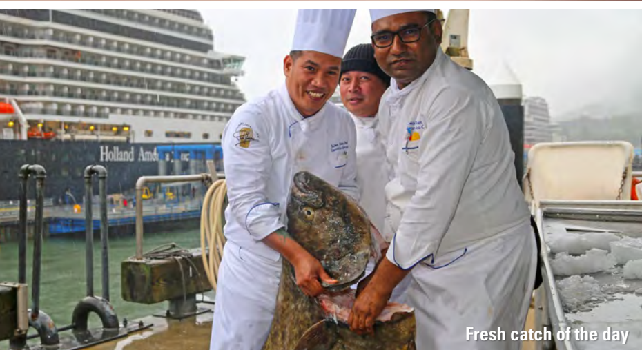
Fresh catch of the day

Looking for even more authentic tastes of the region? Our immersive shore excursions include a number of fun and delicious culinary tours. Sample New England clam chowder, Boston baked beans, lobster rolls, poutine, freshly shucked oysters and other tasty tidbits.