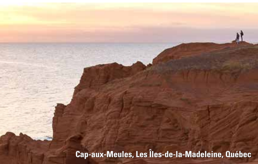
Cap-aux-Meules, Les Îles-de-la-Madeleine, Québec

Did you know that the 1781 "Siege of Yorktown" is widely considered the decisive battle that led to the American Continental Army's victory over the British? Admire Yorktown's lovingly preserved colonial homes and historic battlefields or transport yourself back to the 18th century in Colonial Williamsburg – the U.S.'s largest outdoor educational living museum that keeps alive the story of American independence.