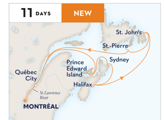
11 DAYS NEW CANADA & NEW ENGLAND CIRCLE: NEWFOUNDLAND & MONTRÉAL ROUNDTrip MONTRÉAL Volendam Aug 16