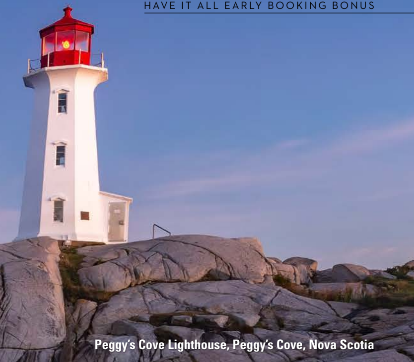
Peggy's Cove Lighthouse, Peggy's Cove, Nova Scotia

Enjoy all the benefits of our standard Have It All package, including Shore Excursion and Specialty Dining credit, plus free prepaid Crew Appreciation, our Low Price Guarantee*, and free upgrades to the Elite Beverage Package and Premium Wi-Fi. Availability is limited, so book before this offer sails away!