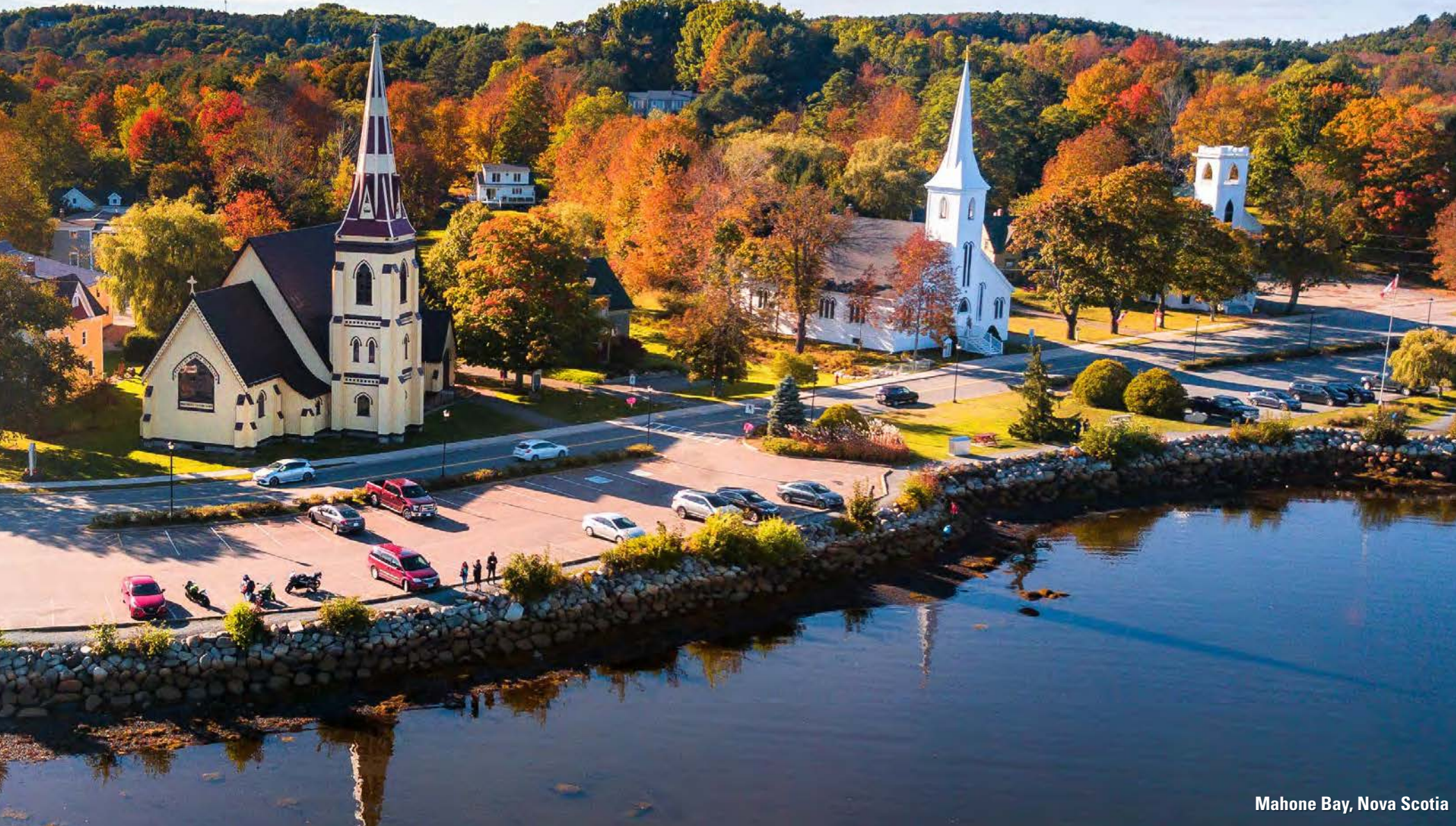
Mahone Bay, Nova Scotia