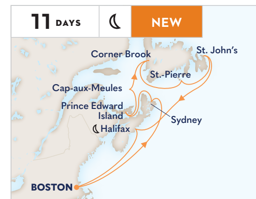
11 DAYS NEW CANADA & NEW ENGLAND CIRCLE: ACADIA & NEWFOUNDLAND ROUNDTrip BOSTON Volendam Jul 1