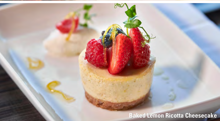
Baked Lemon Ricotta Cheesecake