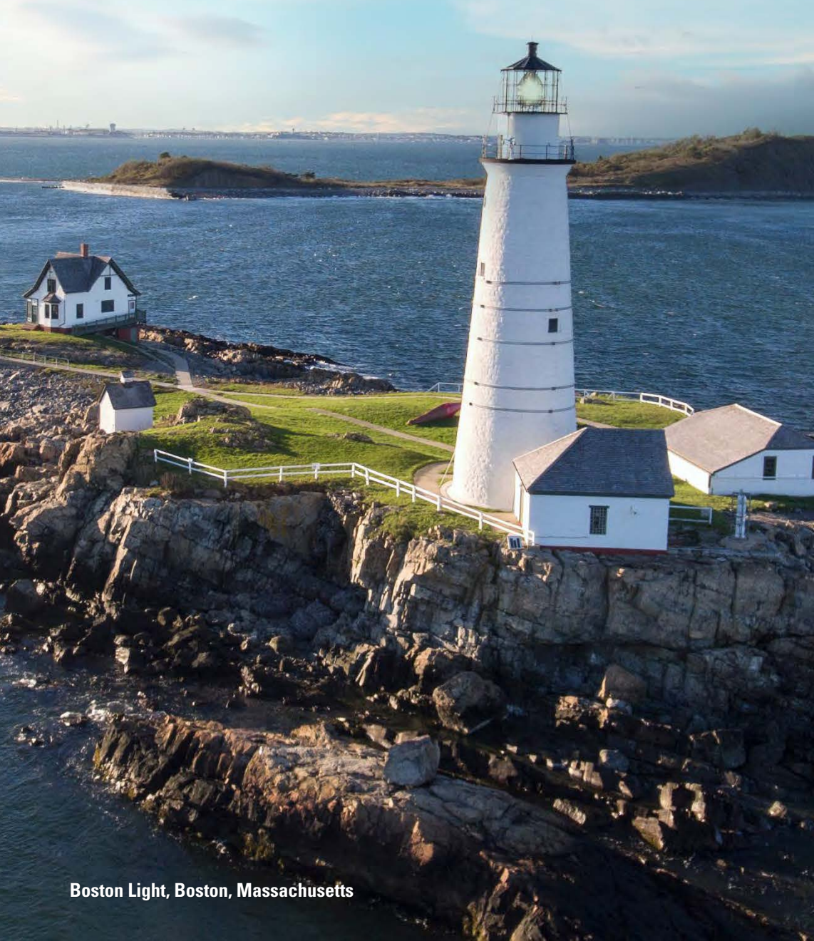
Boston Light, Boston, Massachusetts

Past meets present in Canada & New England's major cities. Admire natural and man-made marvels, taking in fall foliage and gorgeous architecture alike on our September/October sailings. Stroll historic cobblestone streets, 17th-century ramparts, or old-stone alleys en route to Boston's Bull & Finch Pub (the inspiration for the TV show Cheers ), Québec City's trendy Grande Allée thoroughfare, or Montréal's dynamic downtown core.