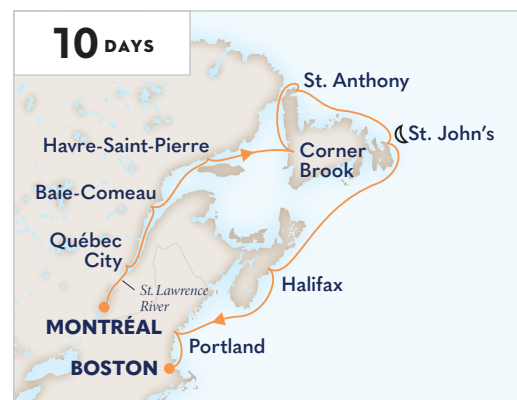
10 DAYS CANADA & NEW ENGLAND: NEW FRANCE & NEWFOUNDLAND MONTRÉAL TO BOSTON Volendam Jun 21