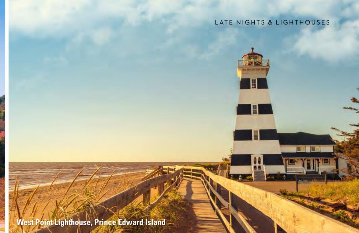
West Point Lighthouse, Prince Edward Island