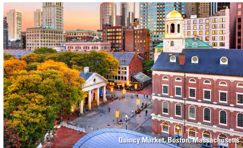
Quincy Market, Boston, Massachusetts