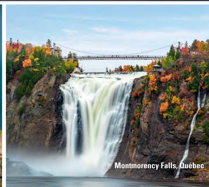
Montmorency Falls, Québec