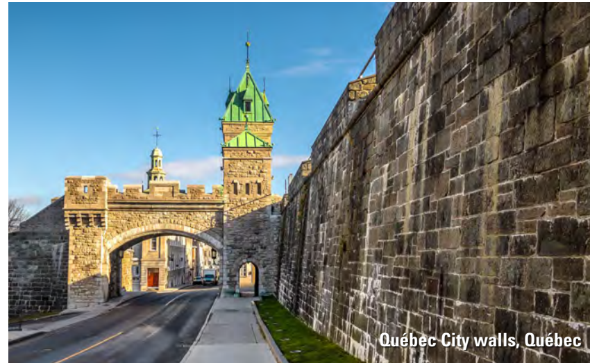
Québec City walls, Québec