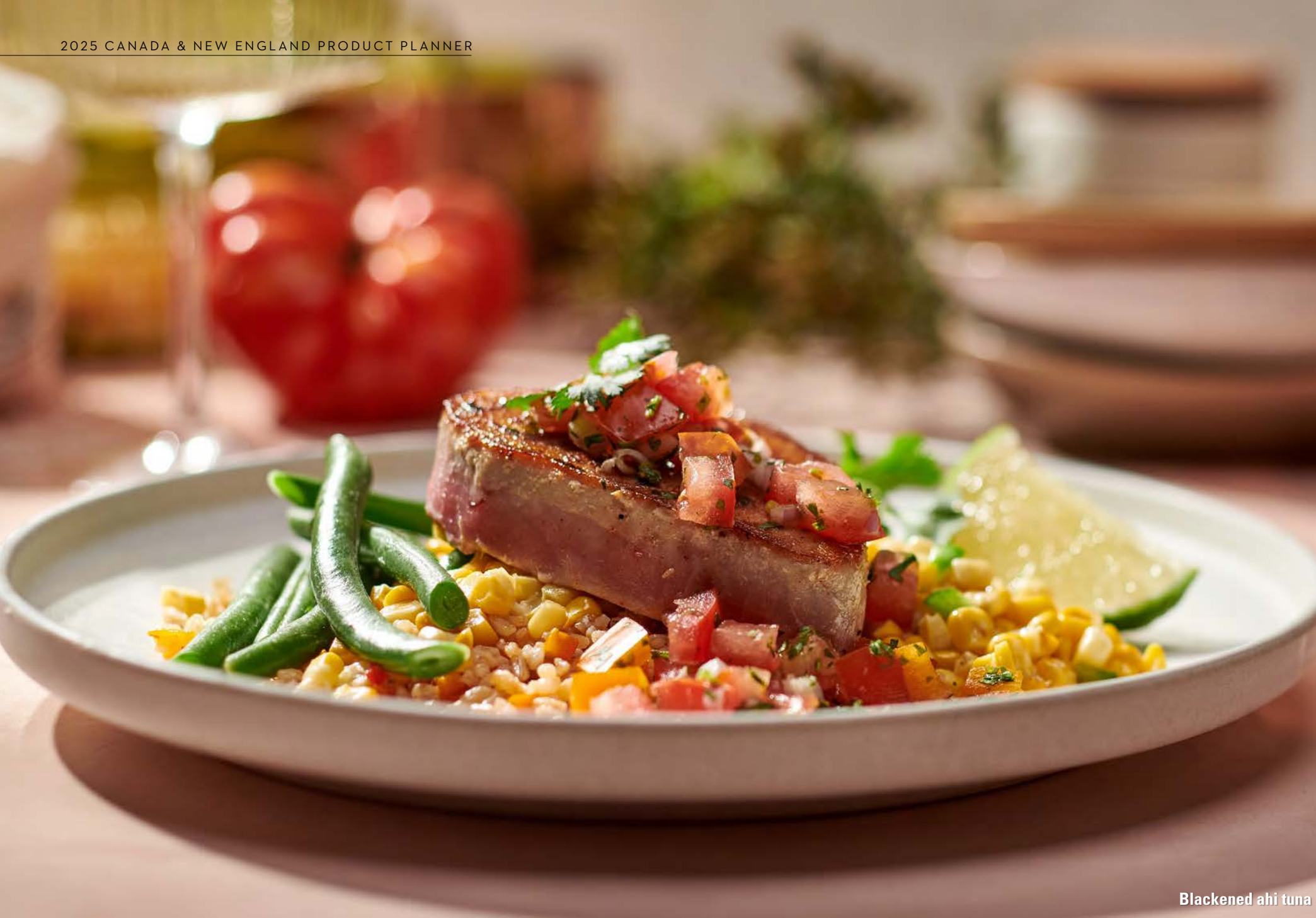
Blackened ahi tuna