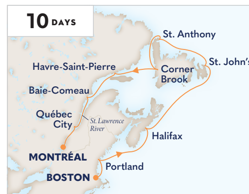
10 DAYS CANADA & NEW ENGLAND: NEW FRANCE & NEWFOUNDLAND BOSTON TO MONTRÉAL Volendam Aug 6