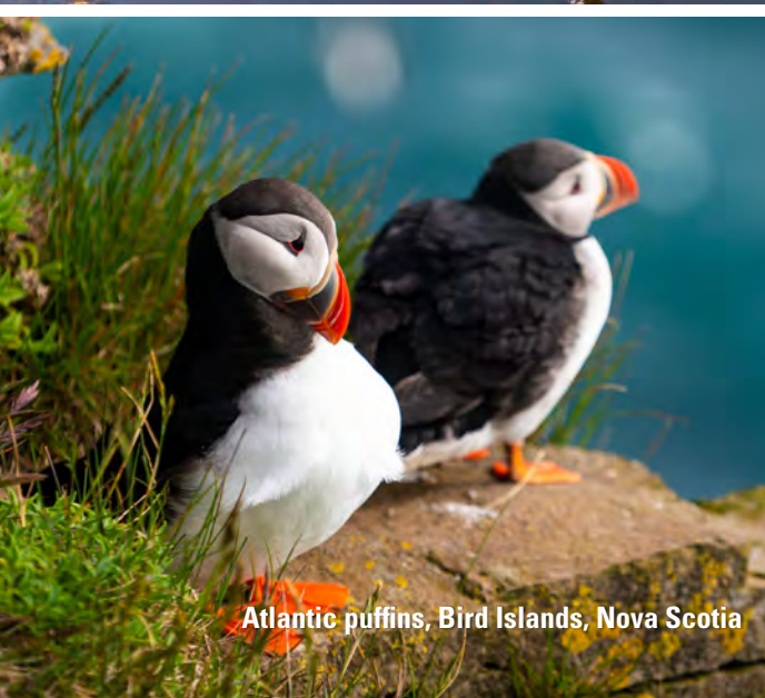
Atlantic puffins, Bird Islands, Nova Scotia

Our 2025 Canada & New England season features more late-night stays than ever before! Spend more time admiring Portland's Victorian houses, Newport's grand mansions, Nova Scotia's picture-postcard villages and so much more. You can also visit the oldest lighthouses in Maine and Prince Edward Island as well as the only one that's shared between the United States and Canada.