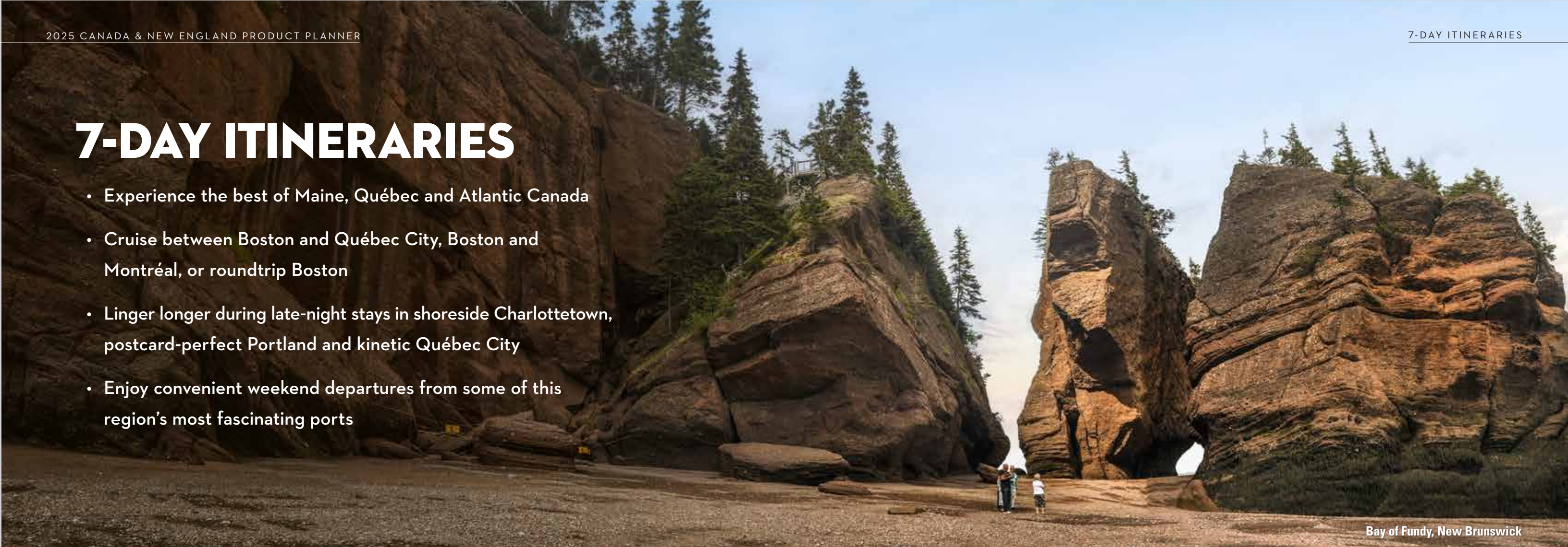
Bay of Fundy, New Brunswick